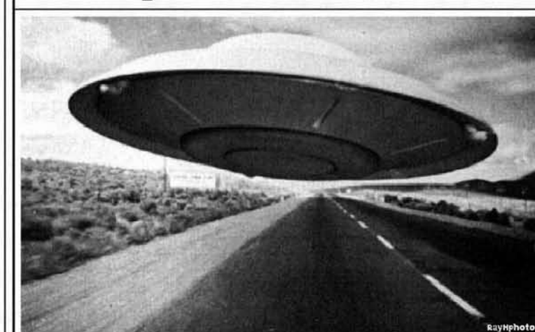
Flying Fiascos- SAUCER JOCKEYS buzz-bomb drivers without warning, hovering and darting. Experts are predicting far more disruption, not less, after the actual X-Day begins on July 5th. (See, "Stang Defies Washington Summons," A-2)