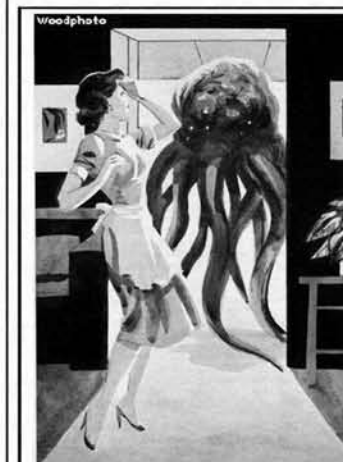
Weird Visitor-SUDDEN SHOCK as Spudville resident confronts amorous extraterrestrial. "It sure knew how to find my G-Spot," she reported. (See R.)